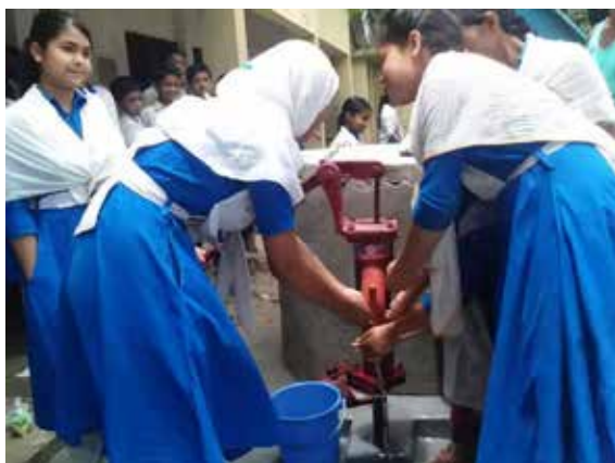
Students taking water from CWB ring well at Terail High School

In the fall of 2014, four Chemists Without Borders interns visited Terail High School in Terail/Chittagong, Bangladesh and gave a presentation on the health hazards of arsenic in drinking water.