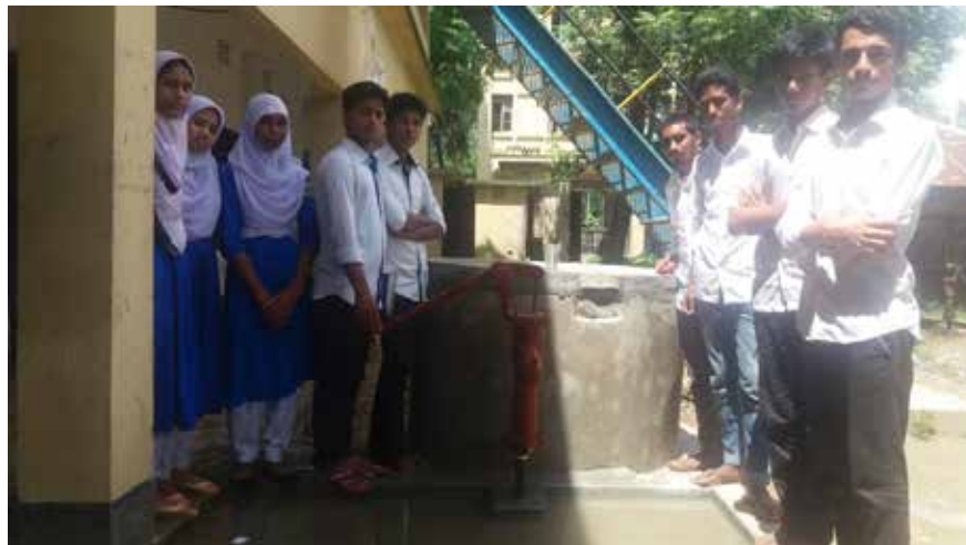
Student Committee at Teriail High School with new ring well

The Sitakunda High School well brings clean water to about 2,500 students; the Teriail High School well supplies clean water to about 1,500 students.